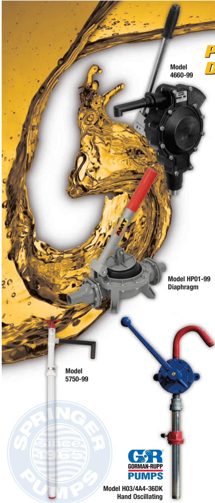
Model HP01-99 Diaphragm