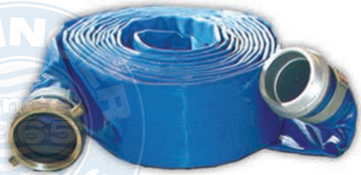
PVC Flexible Discharge Hose