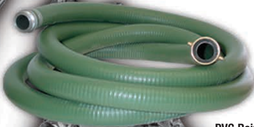
PVC Reinforced Suction Hose